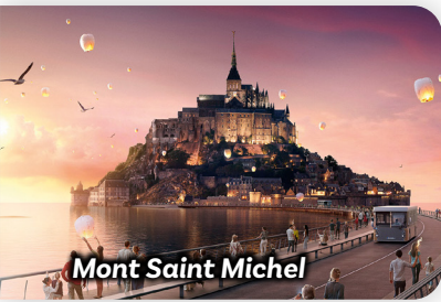
Mont Saint Michel