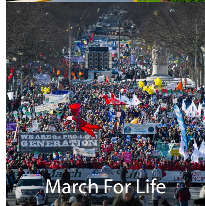
March For Life