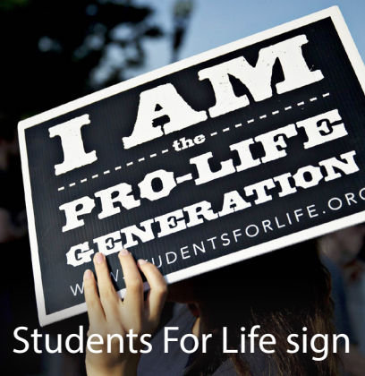
Students For Life sign

Following breakfast we'll check out of the hotel and you will have the option to either visit some of the Smithsonian Museums or celebrate Mass at the Franciscan Monastery of the Holy Land. Encouraged and inspired by the lives of those who came before us, we begin our return trip home from the Reagan National Airport.