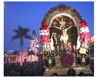
Lord of the Miracles Festival

Christ or Lord of the Earthquakes, more commonly called Lord of the Miracles, is an image of Jesus Christ originally painted on an adobe wall, located behind the High Altar of the Sanctuary and Monastery of Las Nazarenas and venerated in Lima and various parts of the world. The image was painted during the seventeenth century by a slave originally from Angola who was taken to Peru. The festival of the Lord of Miracles is the main Catholic celebration in Peru and one of the largest processions in the world. Mass at the Santuario del Señor de los Milagros. We will also visit the Monastery of the Nazarenos located next to the temple and is the shelter of the Nazarene Discalced Carmelite Mothers. Following lunch, we visit the Lima Cathedral, Saint Domingo Church which houses the remains of 3 Peruvian Saints: San Juan Macías, St. Martín de Porres (the continent's first African-American Saint) and St. Rose of Lima, (the first Saint of the Americas) and see San Pedro Church (panoramic view). We'll also visit the Saint Francis Convent which displays the largest collection of religious art in America. Our highlight will be the visit of the underground vaults, known as Catacombs.