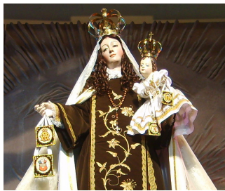
Our Lady of Mount Carmel

Day 3: Oct. 7 Monday Feast of the Holy Rosary. After breakfast we travel to Maipu to venerate our Lady in the National Shrine of Our Lady of Mount Carmel, the Patroness of Chile. The shrine was originally erected in 1818 in thanksgiving for the Chilean independence from Spain. Procession and Mass here. After lunch we proceed to St. Joseph Carmelite Monastery for Holy Hour and afterwards visit with the Nuns. We go back to Santiago. Overnite in Santiago or Maipu.