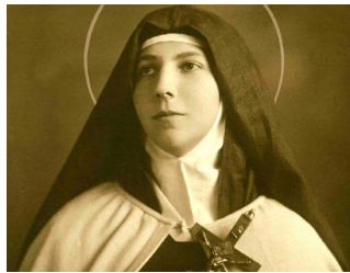
Santa Teresa de los Andes

Day 2: Oct. 6 Sunday Morning arrival in Santiago, Chile, where we will be met by our pilgrimage director. We proceed to the Carmelite Santuario de Sta. Teresa de Jesus de los Andes, the first Canonized Saint of Chile and where her remains rest. Mass at the Carmelite Monastery where she entered and where she died. She had recorded earlier “To die is to be eternally immersed in Love”. Visit with the Nuns. Time permitting we visit the Cathedral of Santiago, city tour, and proceed to hotel for check in. Welcome dinner. Overnite in Santiago.