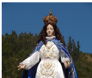
Our Lady Purísima de Lo Vásquez

Day 5: Oct. 9 Wednesday Cusco is the historic capital of the Inca Empire and the treasure of the colonial architecture. We start with Mass at the Cathedral and, after breakfast, a city tour of Cusco, visiting the archeological sites of Sacsayhuaman, Qenko, PucaPucara, and Tambomachay, and the famous Temple of the Sun, Qoricancha, or the “Enclosure of Gold”. Holy Hour at the Cathedral. Overnight in Cusco.