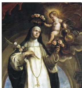
St. Rose of Lima

Day 12: Oct. 16 Wednesday After enjoying breakfast, we'll explore Lima, capital of Peru and a city rich in cultural sites and remarkably preserved architecture. This splendid city, being founded on the feast of the Epiphany, was first named "City of Kings" (Ciudad de los Reyes), in reference to the "Three Wise Men." Lima's downtown is declared a World Heritage Site by UNESCO. We'll see the Plazas de Armas, the Cathedral, and the ornate Archbishop's Palace, and the