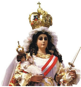
Virgen de Chapi