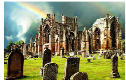
Melrose Abbey, Roxburghshire