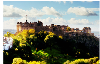
Edinburgh Castle, Edinburgh