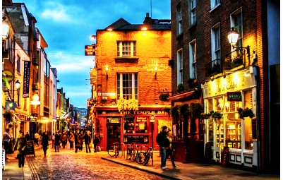
Temple Bar, Dublin

October 27 ~ With a renewed sense of pilgrimage, and an invigorated love of our Catholic faith, we'll transfer to Dublin this morning to board our plane for the return flight home.