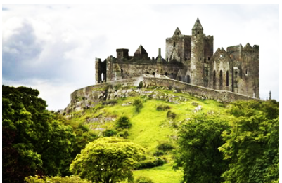
Rock of Cashel, County Clare