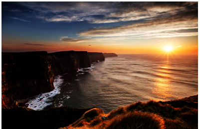
Cliffs of Moher, County Clare