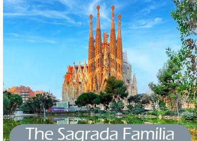
The Sagrada Família