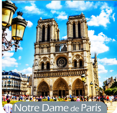
Notre Dame de Paris

Oct. 5: Our pilgrimage begins as we depart from San Antonio International Airport, Texas, to Lisbon, Portugal.