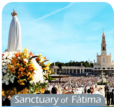
Sanctuary of Fátima